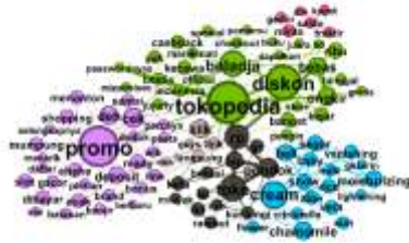
Figure 4 Tokopedia Network Visualization