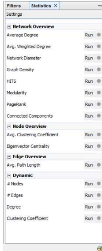
Figure 2 Network Properties